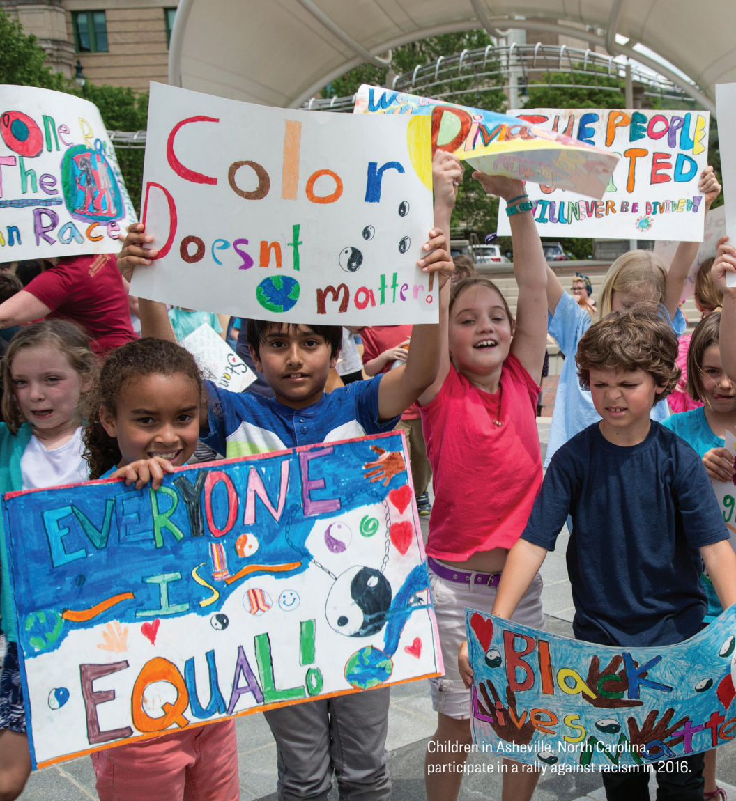
Children in Asheville, North Carolina, participate in a rally against racism in 2016.

with hate experts like the Southern Poverty Law Center. Urge editorial writers and columnists to take a stand against hate.