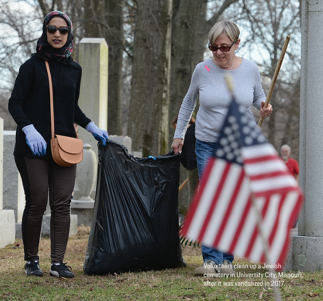
Volunteers clean up a Jewish cemetery in University City, Missouri, after it was vandalized in 2017.